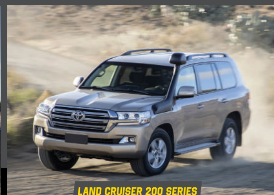
LAND CRUISER 200 SERIES