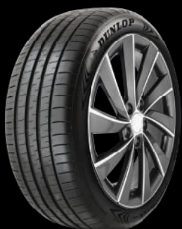
SP SPORT MAXX 060+