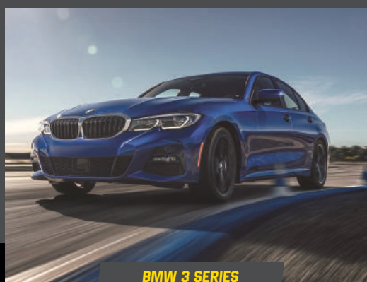
BMW 3 SERIES