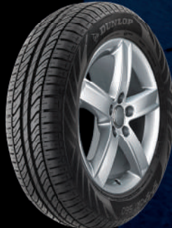
SP SPORT 560